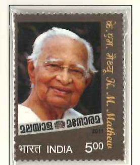
K.M. MATHEW (2.1.1917-1.8.2010) Wrote 'Annamma' & autobiography 'Ettamathe Mothiram' (1.8.2011).