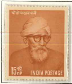
DHONDO KESHAV KARVE (18.4.1858-9.11.1962) Wrote two autobiographies. It was a first time that a living person was on the issued stamps (18.4.1958).