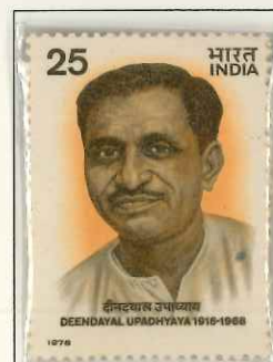
DEENDAYAL UPADHYAYA (25.9.196-11.2.1968) Wrote a biography of Sankaracharya and of Hedgewar (5.5.1978)