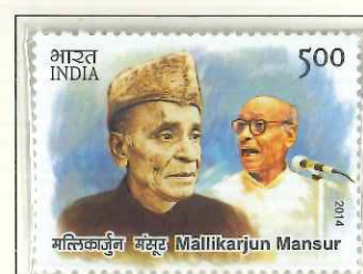
MALLIKARJUN MANSUR (31.12.1910 - 1992) Wrote an autobiography 'Nanna Rasayatra; in Kannada which has been translated into English as 'My Journey in Music' (3.9.2014).