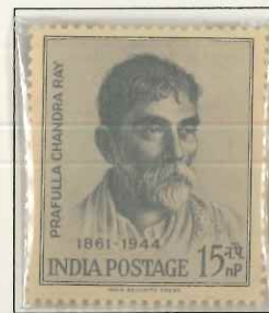
ACHARYA PC RAY (2.8.1861-16.6.1944) Wrote 34 books & 31 book-lets & his autobiography life and experience of a Bengal Chemist