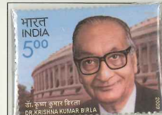
DR KRISHNA KUMAR BIRLA (11.11.1918-30.8.2008) Wrote his autobiography 'Brushes with History' & other books (13.3.2009).