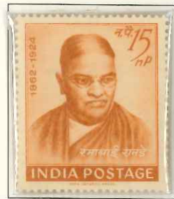
RAMABAI RANADE (25.1.1863-1924) Wrote her autobiography, 'Amachya Ayushyatil Athavani' in Marathi (15.8.1962).