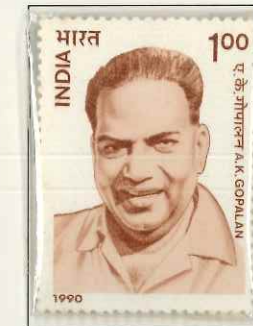
A K GOPALAN (b.1.10.1904) Wrote extensively & his autobiography 'In the cause of the people' was translated into many languages (1.10.1990).