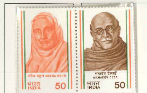
MAHADEV DESAI (1.1.1892-5.8.1942) Wrote several biographies like Sant Francis, Vir vallabh bhai (9.8.1983).