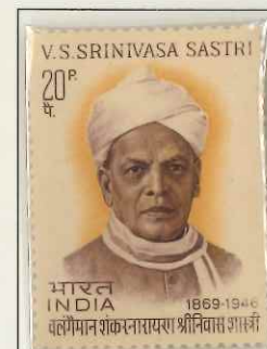
V.S. SRINIVASA SASTRI (1869-1946) Wrote report on condition of Indian labour in Malaya & corrected manuscript of autobiography wrote by MK Gandhi (22.9.1970).