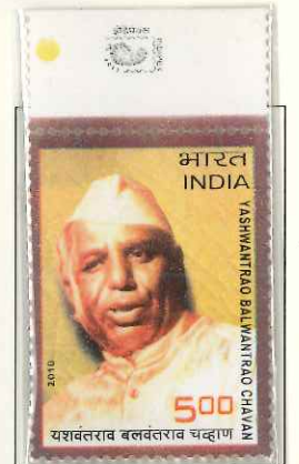
Y.B. CHAVAN (12.3.1913-25.11.1984) Wrote his first volume of autobiography 'Krishna kath' (22.12.2010).