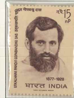
U P G DAS (9.10.1877-17.6.1928) Eminent poet & writer, wrote 'Bandira Atma Katha' while in prison (4.1.1964).