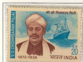
V.O. CHIDAMBARAM PILLAI Wrote his autobiography & 3 more books (5.9.1972).