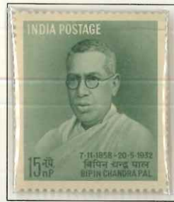
BIPIN CHANDRA PAL (7.11.1858-20.5.1932) Wrote biography on Queen Victoria & few more books (7.11.1958).