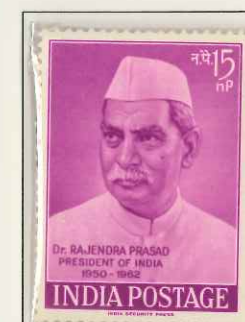
DR. RAJENDRA PRASAD Wrote many books besides his autobiography (Atmakatha-1946) (3.12.1984).