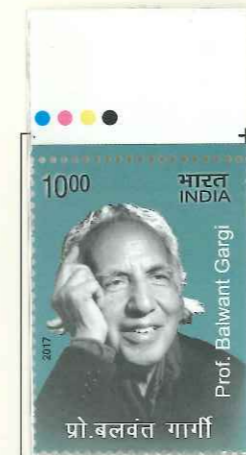
Prof. BALWANT GARGI (1916-2003) A dramatist, Theatre Director, Novelist and Short story writer (31.5.2017).