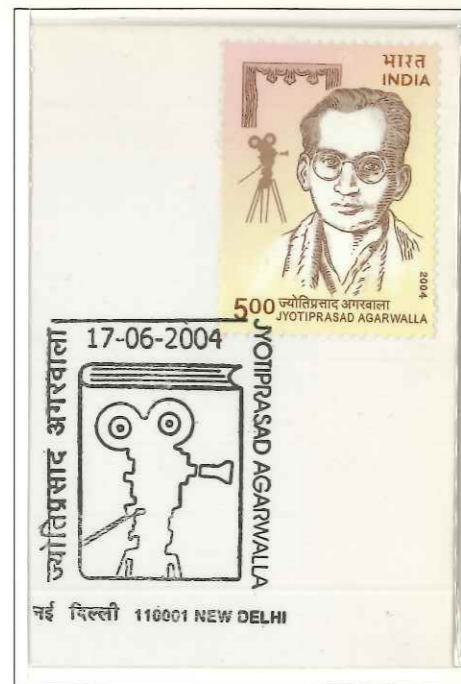
JYOTIPRASAD AGARWALA (1903-1951) Noted Assamese play writer, song writer (300 songs) writer & film maker (17.6.2004).