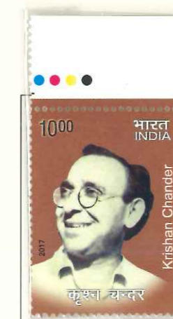
KRISHAN CHANDER (1914-1977) Prolific writer, Novelist, Short story writer (31.5.2017).