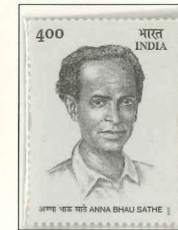
ANNA BHAU SATHE (1920-1969) Wrote 35 novels, short stories, plays, ballads (1.8.2002).