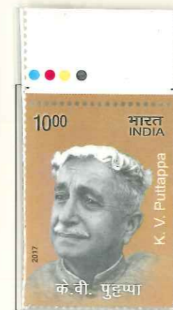
KV PUTTAPPA (1904-1994) A Novelist, Poet, Playwright and Critic (31.5.2017).