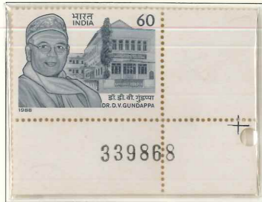
DR. D V GUNDAPPA (1889-1975) Wrote poetry (10), essays (4), dramas (5), biographies (7), political works (6), spiritual (4), 2 children works (17.3.1988).