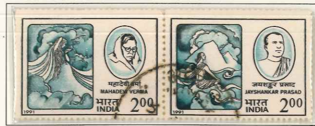
JAISHANKAR PRASAD (30.1.1889-14.1.1937) Wrote 4 poetry, 4 drama, 8 story, 3 novel books. His poem Kamayani is depicted on the stamp(16.9.1991).