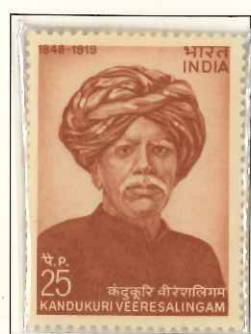
KANDUKURI VEERESALINGAM (16.4.1848-27.5.1919) Wrote 100 books, mostly on social evils (15.7.1974).