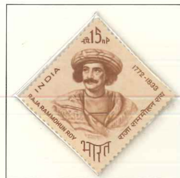
RAJA RAMMOHAN ROY (22.5.1772-27.9.1833) First diamond shaped stamp. A scholar, wrote two memorials, best known for his efforts to abolish Sati (27.9.1964).