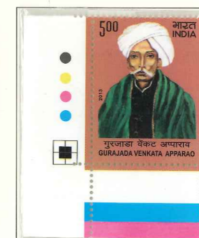
GURAJADA VENKATA APPARAO All writings of Gurajada aimed at social reform (21.9.2013).