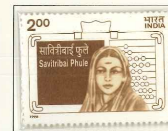
SAVITRIBAI PHULE (30.1.1831-10.3.1897) Wrote books & worked for women's rights during British Rule (10.3.1998).