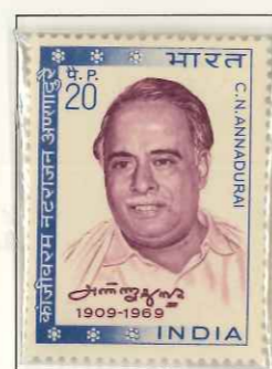
C.N. ANNADURAI (1909-1969) Wrote plays, film stories, dialogues, all aimed at social reforms (3.2.1970).