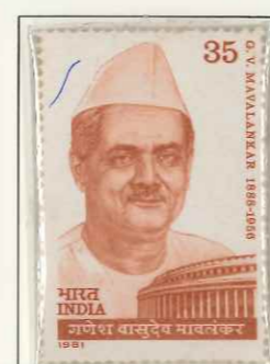
GANESH VASUDEV MAVALANKAR (27.10.1888-27.2.1956) A Parliamentarian, social worker, educationist & writer as well (27.2.1981).