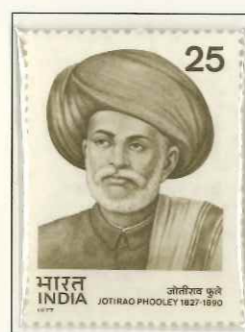
JYOTHI RAO PHOLAY Wrote 'Shivajicha Powdda' & 16 books; a pioneer of women's education in India (28.11.1977).