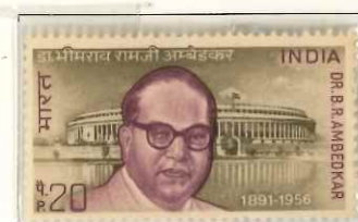
DR. B R AMBEDKAR (14.4.1891-6.12.1956) A Bharatratna, Jurist, Writer & Reformer (14.4.1991).