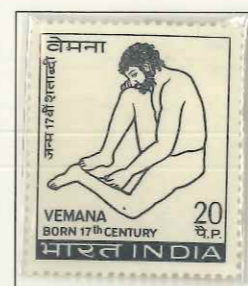
VEMANA (BORN 17th CENTURY) Telugu philosopher, poet, a great social reformer (16.10.1972).