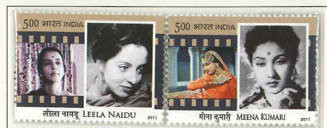
MEENAKUMARI (1.8.1932-31.3.1972) : An actress & wrote Urdu poetry using the pen name 'Naar'. Her biography was released after her death.