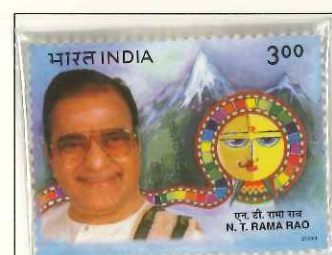
NT RAMARAO (8.5.1923-18.1.1996) Writer for 16 films in Telugu (28.5.2000).