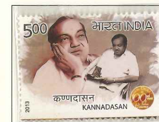
KANNADASAN (24.6.1927-17.10.1981) A poet, novelist, lyricist, editor, writer in Tamil who wrote 5000 lyrics, 6000 poems & 232 books. Also wrote 2 autobiographies(3.5.2013).