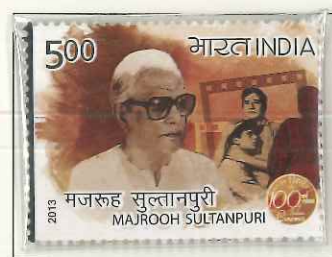
MAZROOH SULTANPURI (1.10.1919-24.5.2000) An Urdu poet, lyricist, notable ghazal writer & song writer. First lyricist to win Phalke award (3.5.2013).