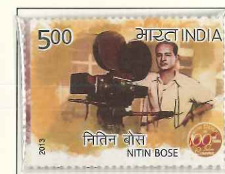
NITIN BOSE (26.4.1897-14.4.1986) Screen writing for Doop Chhaon, Bhagya Chakra; Didi etc (3.5.2013).