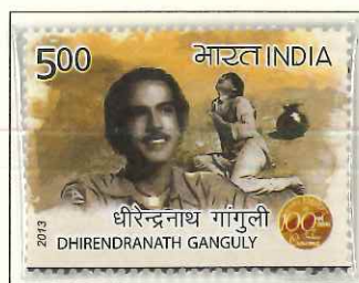
DHIRENDRANATH GANGULY (26.3.1893-18.11.1978) wrote for "Shesh Nibedan (1948-screen play) (Bilet Pherat (1921-writer) (3.5.2013).