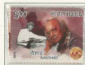
NAUSHAD (25.12.1919-5.5.2006) A poet & wrote book 'Aathwaan Sur' (The eighth Note) (8.5.2013).