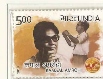
KAMAAL AMROHI (17.1.1918-11.2.1993) Film Director, screen & dialogue writer; Urdu & Hindi poet; wrote scripts for Sohrab Modi Abdul Rashid Kardar & K. Asif. Also wrote for Mughal-e-Azam