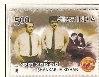
SHANKAR & JAIKISHAN Composed music for Hindi films & wrote 'ever lasting; & immortal melodies in the 50's & 60's (3.5.2013).