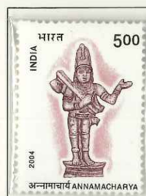
ANNAMACHARYA (1408-1503) First Vaggeyakara and wrote 30,000 keerthanas (18.3.2004).