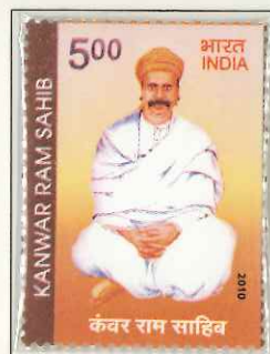
BHAGAT KANWAR RAM (13.4.1885-1.11.1939) Sindhi singer and Sufi poet (26.4.2010).