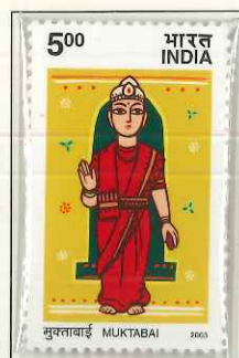
MUKTABAI (1279-1297) A saint in Varkari tradition & wrote 41 Abhangas including Tatiughada