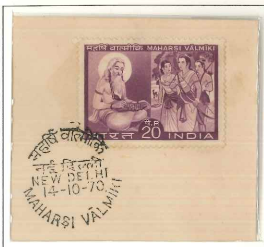
VALMIKI wrote Ramayana in Sanskrit