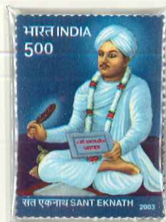
EKNATH(1533-1589) Wrote 300 religious songs in Abhanga form including Bharood.