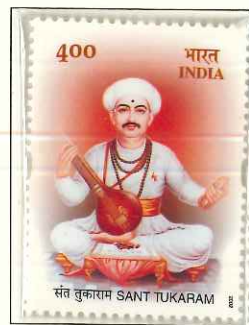
SANT TUKARAM (1598-1650) Spread his message of love and harmony through Abhangas (10.8.2002).