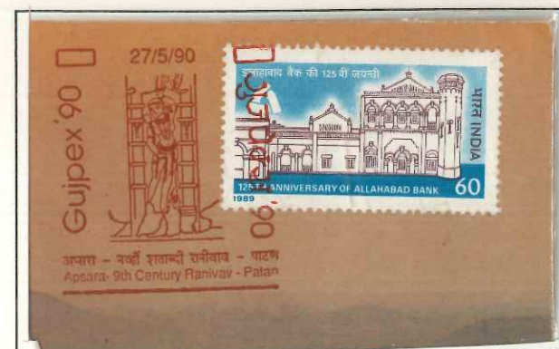
Apsara Ranivav-Patan, near to river Sarasati