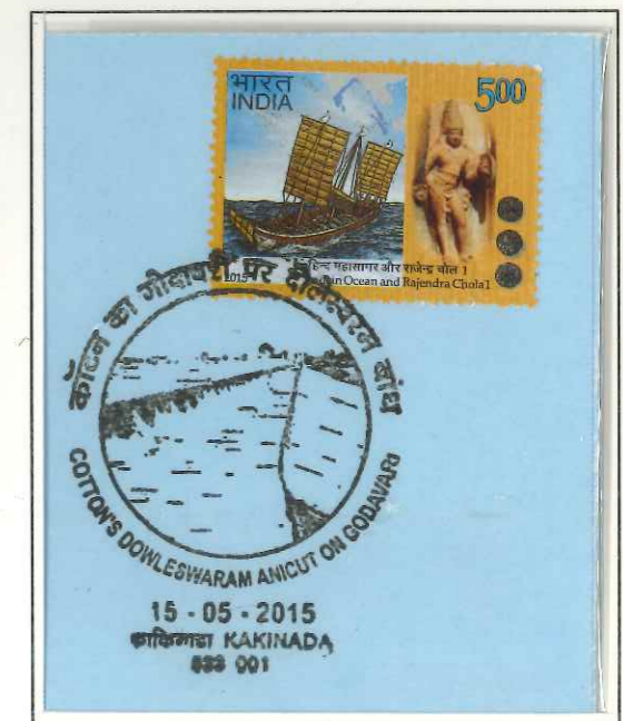
Cotton's Dowleswaram Anicut on river Godavari in Andhra Pradesh