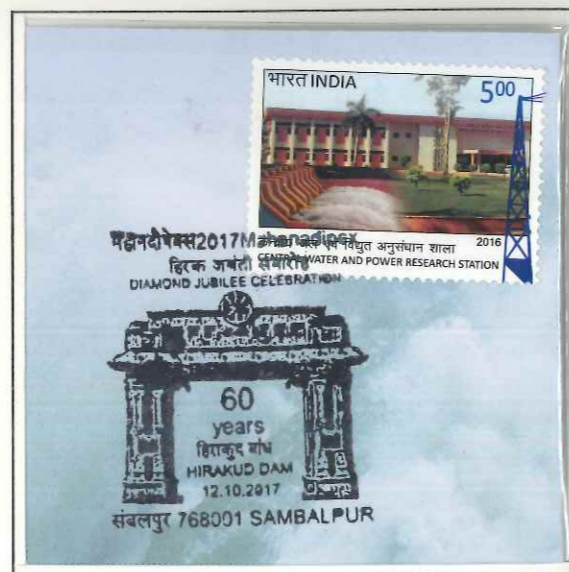
Hirakud dam on river Mahanadi in Odisha