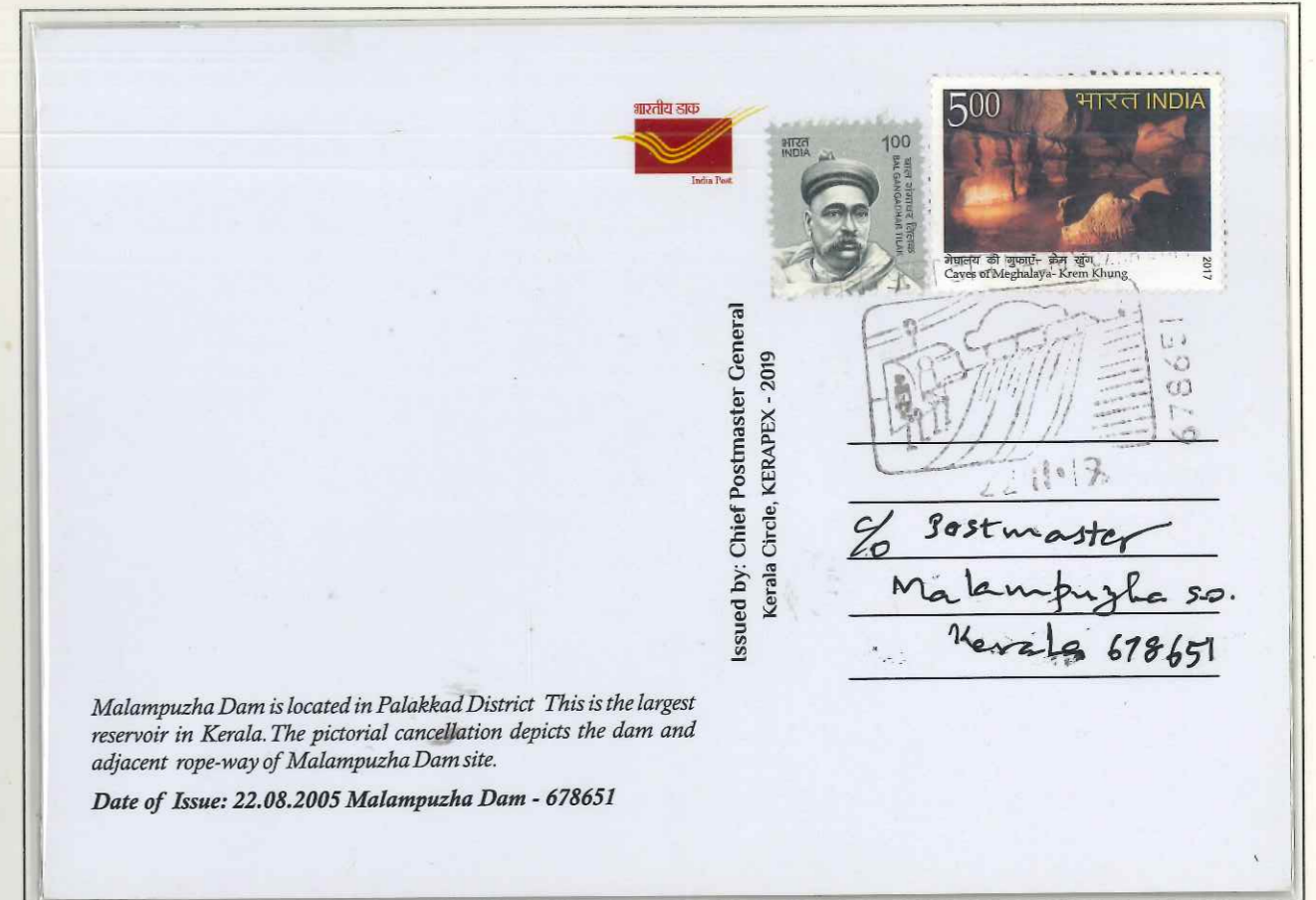
Malampuzha Dam in Kerala-Pictorial Cancellation