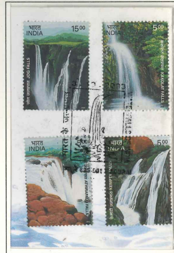
Waterfalls often form in the upper stages of a river where it flows over different bands of rock. It erodes soft rock more quickly than hard rock and this may lead to the creation of a waterfall.