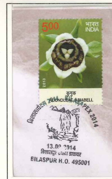
Kendai waterfall is on the rivers Hasdeo & Bango on the Bilaspur-Ambikapur State highway No. 5 near Korba