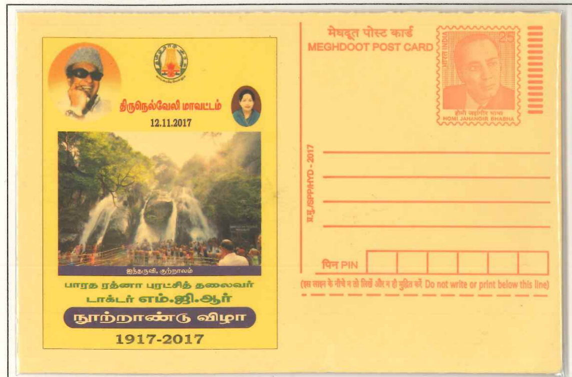
Courtallam Waterfalls on river Chittar in Tamil Nadu