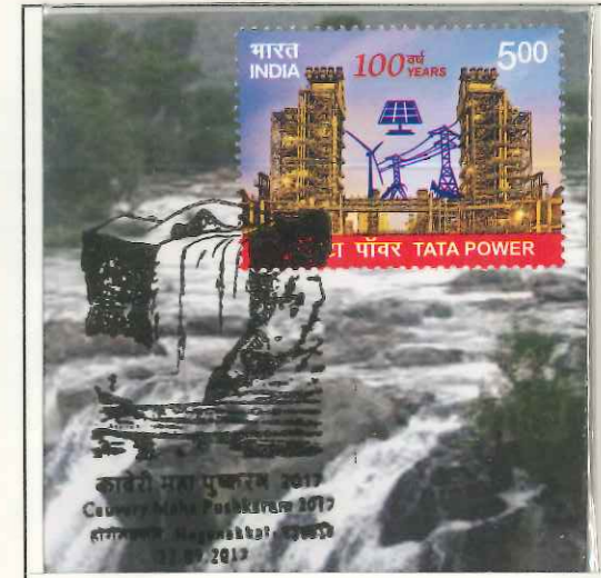
Hogenakkal Falls is a waterfall on the Cauveri river on the border between Dharmapuri district of Tamil Nadu and Chamrajnagar district of Karnataka. The Shivanasamudra Falls is on the Cauveri River after the river has found its way through the rocks and ravines of the Deccan Plateau.