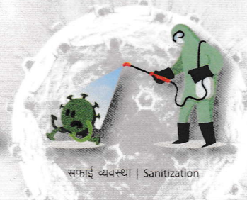
सफाई व्यवस्था | Sanitization