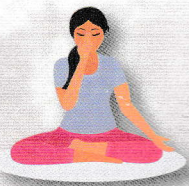
योग | Yoga