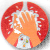
हथ धोना | Wash Hands

The price of the envelope was Rs.100 and Rs.75 from the proceeds of this cover was donated to the Chief Minister Relief Fund.