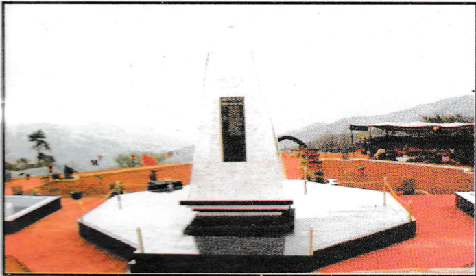
वार मेमोरियल शंशक (मणिपुर) WAR MEMORIAL SHANGSHAK (MANIPUR)